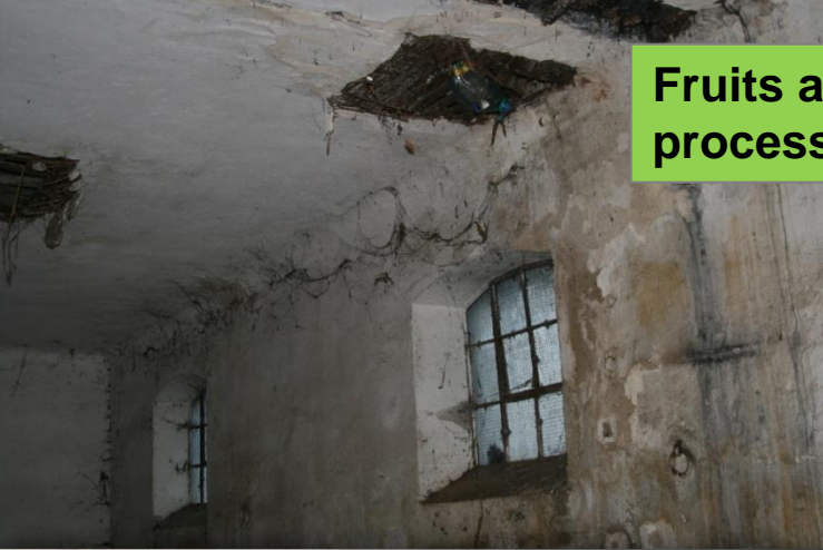
Fruits and vegetables processing pilot plant