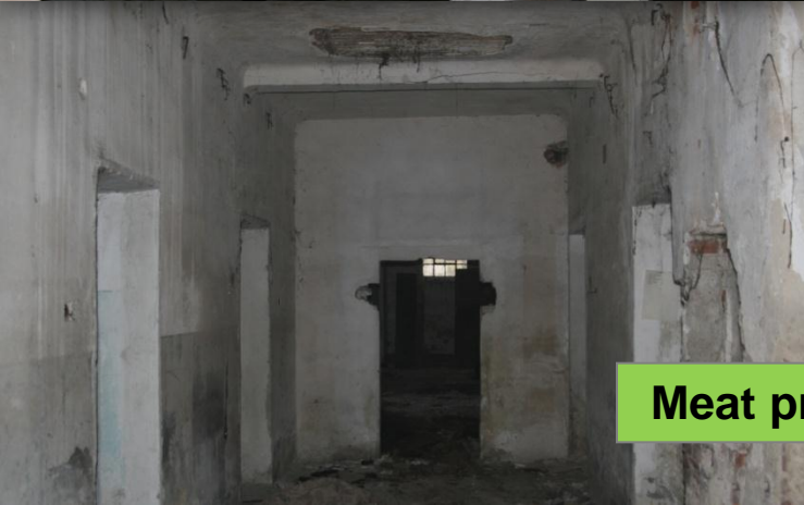
Meat processing pilot plant